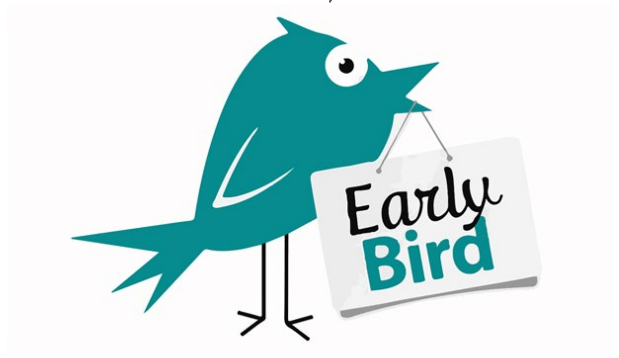
Fall Association Early Bird Campaign

New Hampshire Tax and Accounting Professionals Member Benefit Newsletter for July 2020